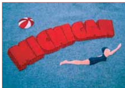
"Water Wonderland" Wool Pillow