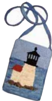
"Small Shoulder Bag"